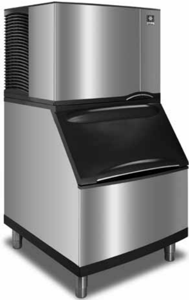
SY-0504A Ice Machine on B-570 Bin